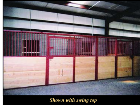
Shown with swing top

This sturdy 14 gauge, 1 1/2" square tubing framework is already primed and painted. Standard colors are brown, black or green, other colors or finishes are available. Dividing walls can be bar top, two thirds bars or solid. The customer provides the 2x10 or smaller wood fill to finish.