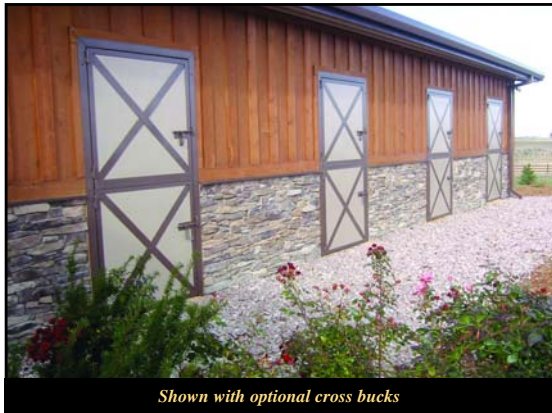
Shown with optional cross bucks

Dutch Doors come complete with 3"x3" x 3/16" angle iron jamb. Door frame is 2"x2" x 3/16" angle iron. Comes complete, no filler materials needed.