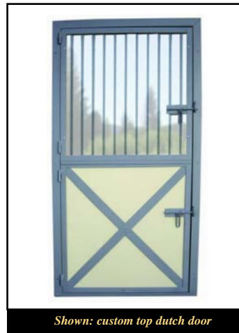
Shown: custom top dutch door

Options: size wood exteriors cross bucks or your custom designed inserts.