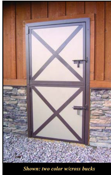
Shown: two color w/cross bucks

Options: size wood exteriors cross bucks or your custom designed inserts.