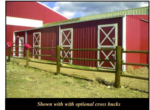
Shown with with optional cross bucks

Features an inside-outside latched door, now comes with pin latch to hold top and bottom together.