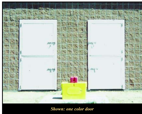
Shown: one color door

Door panels are 24 gauge metal, both sides laminated to 3/4" plywood, primed and painted. Standard 4'x8', R.O. 48-1/2" x 96-1/2"