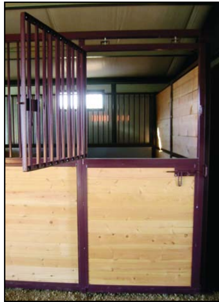
Half Swing Top

These options are available on any stall door.