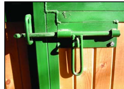
Bolt Latch is standard on laminated and tongue and groove stall.