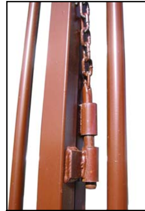
Pin Latch is standard on wood fill doors.

We will customize sizes, finish, design, construction to fit your specific needs. Provide us with the idea and we will provide the product.