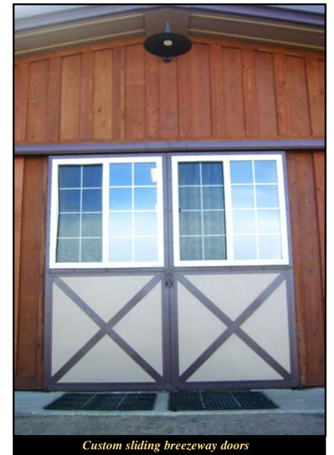
Custom sliding breezeway doors